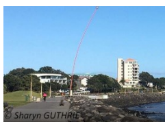
New Plymouth Genealogy Society

Another successful Facebook month for new members with our numbers increasing from 194 to 205 members. Please post any queries or add posts about your family to share. This is for our members plus others interested in Taranaki genealogy to view.