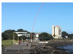
New Plymouth Genealogy Society