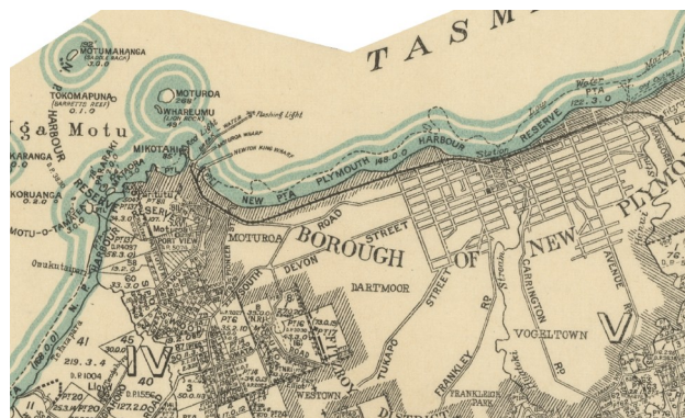
Moturoa area, 1939